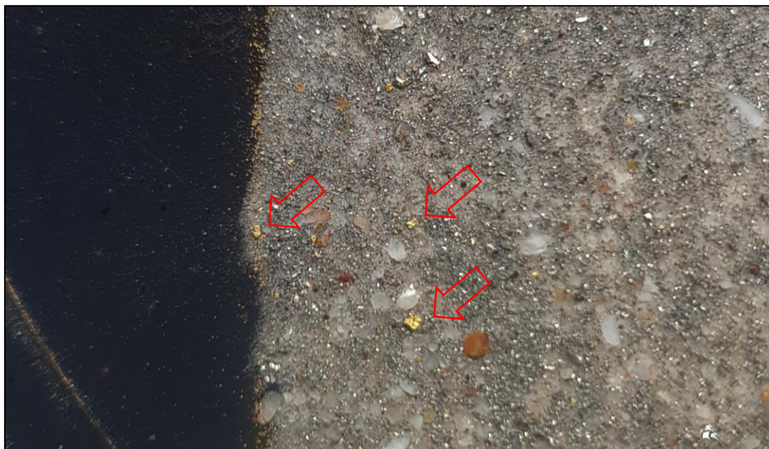
Figure 3. Photo of small gold nuggets recovered from panned concentrates in sample number NMRMW-BS028. The presence of small nuggets demonstrates to NMR that the area is “nuggety” in its style of mineralisation and that the gold is accessible using simple gravity separation techniques. A few of the many small nuggets are highlighted in the photo above. Additional fine gold can be seen distributed along the left-hand edge of the panned concentrates.